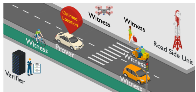
Fig. 1. Connected vehicles cooperating in road. Other devices acting as witnesses for location proofs. The proofs can be verified all these entities.

In this work we propose ROAD, Resilient lOcation for Autonomous Driving, a subsystem that acts as a location PIP, resilient to GPS spoofing and other location-based services