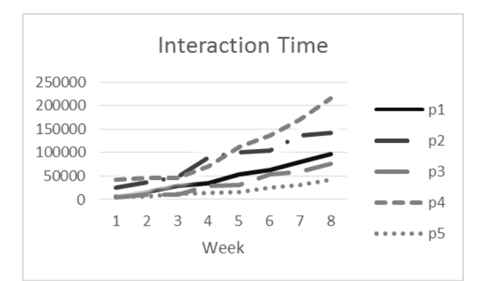
Figure 3. Cumulative interaction time during the eight weeks by each participant in seconds.

Sharing experiences can also be exactly what the users need to bootstrap their device usage. P4 in the first weekend with the device explored the it with a friend. P4 was by far the most adventurous explorer in the first week alone he used 33 unique applications (Figure 2). Knowing other smartphone users greatly promoted the discoverability of new applications.