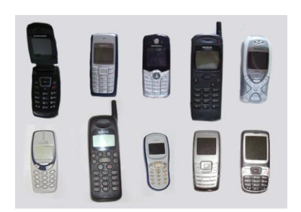
Figure 2 - Mobile devices used in the evaluation

Results showed that different capability levels have significant impact on user performance and that this